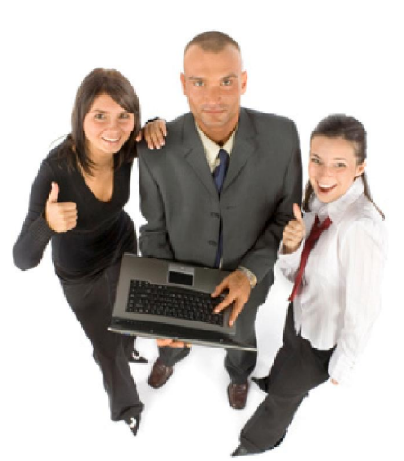
Figure 1 Complete Success with CDI Premium for Windows

Virtually all business transactions affect financials. So the software managing your accounting, cash flow, and banking transactions must integrate with other functions, such as purchasing and sales. The CDI® Premium application provides a reliable, integrated solution to optimize financial processes.